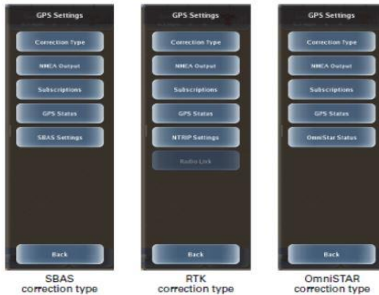
Figure 1-6: Correction types and related GPS Settings panel buttons

Depending on the correction type you select (see “Correction Type” different buttons may appear on the GPS Settings panel (as shown in Figure 1-6).